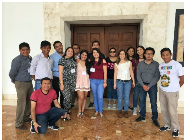
Figure 10. A group of Mexican students enjoying ABCChem in Cancun, January 2018.

One significant development to come out of this collaboration was the first Atlantic Basin Conference on Chemistry (ABCChem, Figure 10). [49] This conference, which is aimed at bringing together chemists from countries around the Atlantic and especially at building collaborations between people from disparate countries who would not otherwise meet, is sponsored by ACS, the Brazilian Chemical Society, the Canadian Society for Chemistry, EuChemS, and the Mexican Chemical Society, and is supported by the Federation of Chemical Societies of Africa, the South African Chemical Institute, and the Federation of Latin American Chemical Societies. The first ABCChem, held in Cancun, Mexico attracted > 200 people from around the Atlantic and provided a forum for chemists of very different backgrounds to exchange ideas and start to build collaborations. Discussions are ongoing as to where, when and whether this experiment should be repeated.