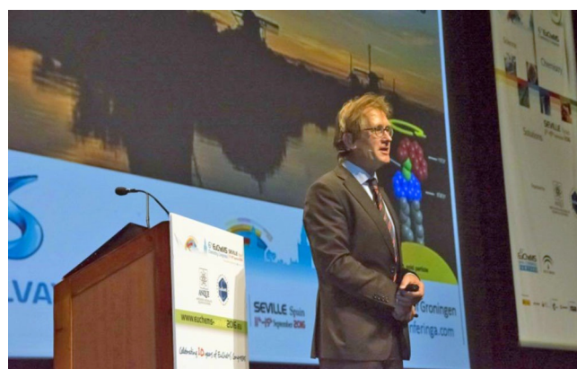
Figure 6. European Gold Medal winner, Ben Feringa giving the closing (August Wilhelm von Hofmann Denkmünze) lecture at ECC-6 weeks before being awarded the Nobel Prize in Chemistry.